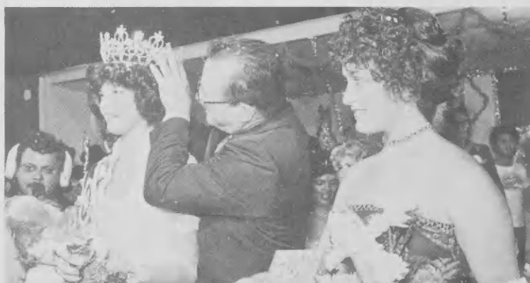
Lt. Governor Frans Figaroa crowns 1981 Aruba Carnival Queen Connie Irausquin.